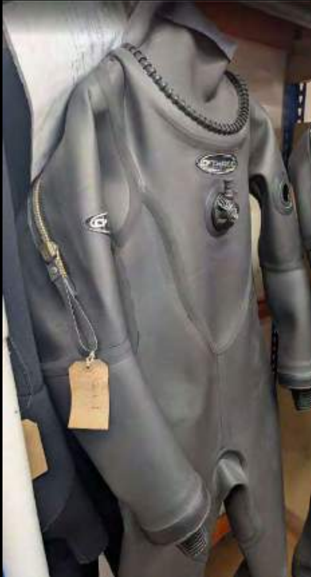
Rubber coated neoprene prototype drysuits